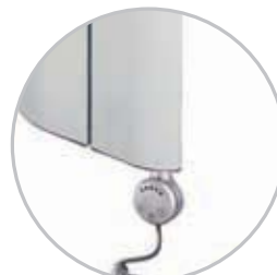
Electrical kit 2