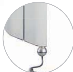
Electrical kit 1