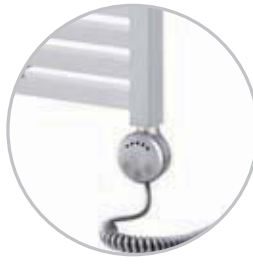
Electrical kit 2