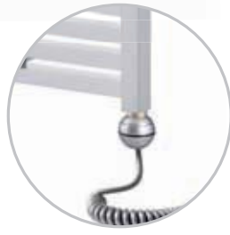
Electrical kit 1